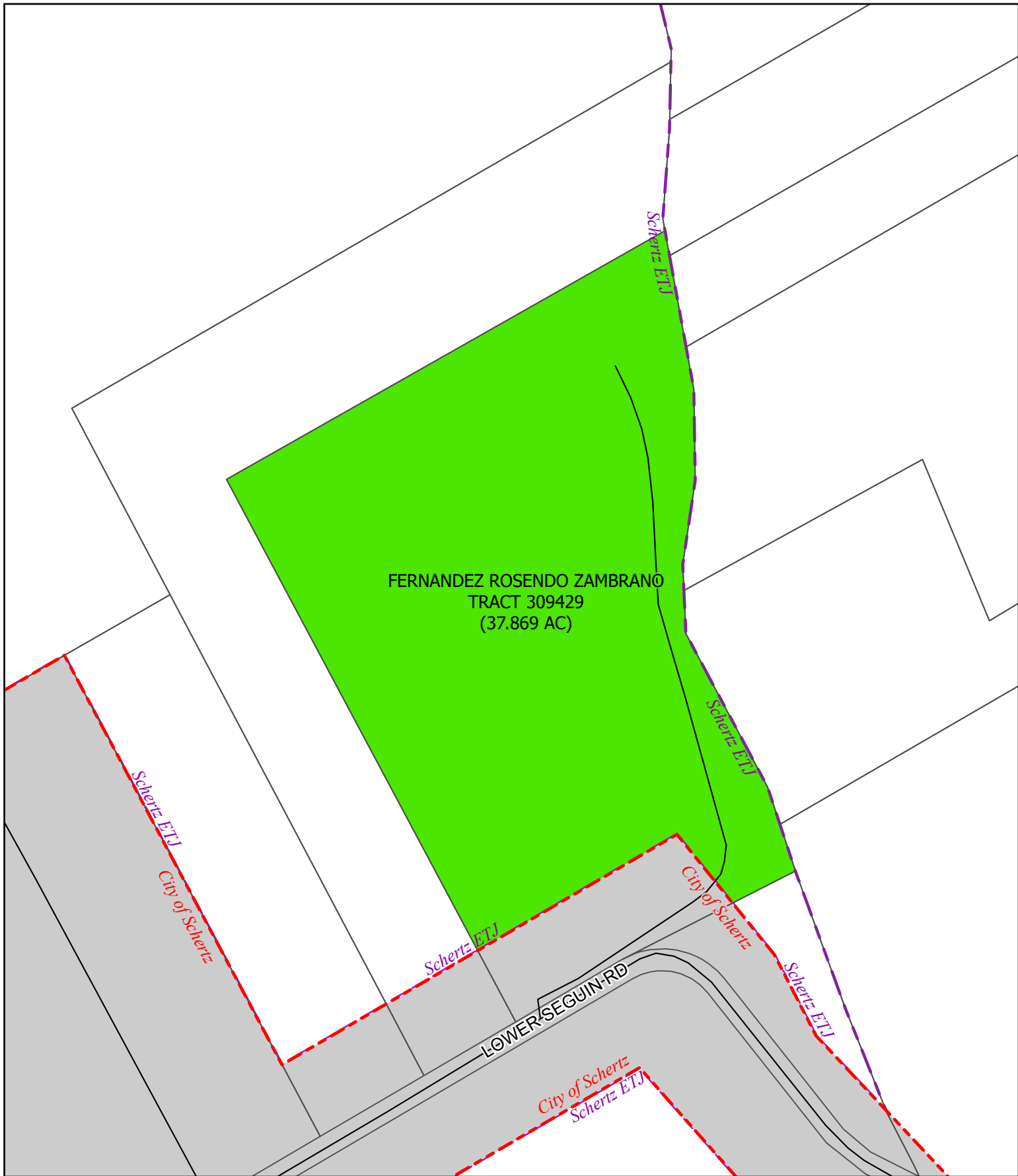
Exhibit "A" : Property Depiction