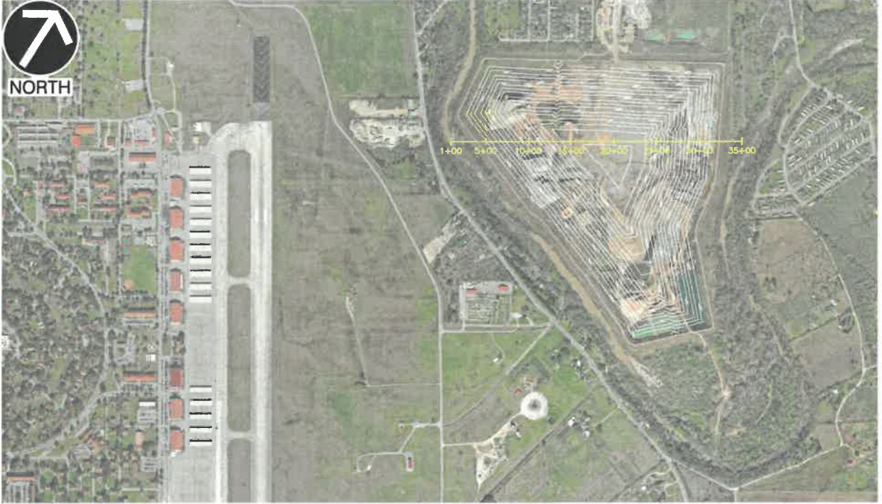
PLAN VIEW SCALE: 1" = 1000'