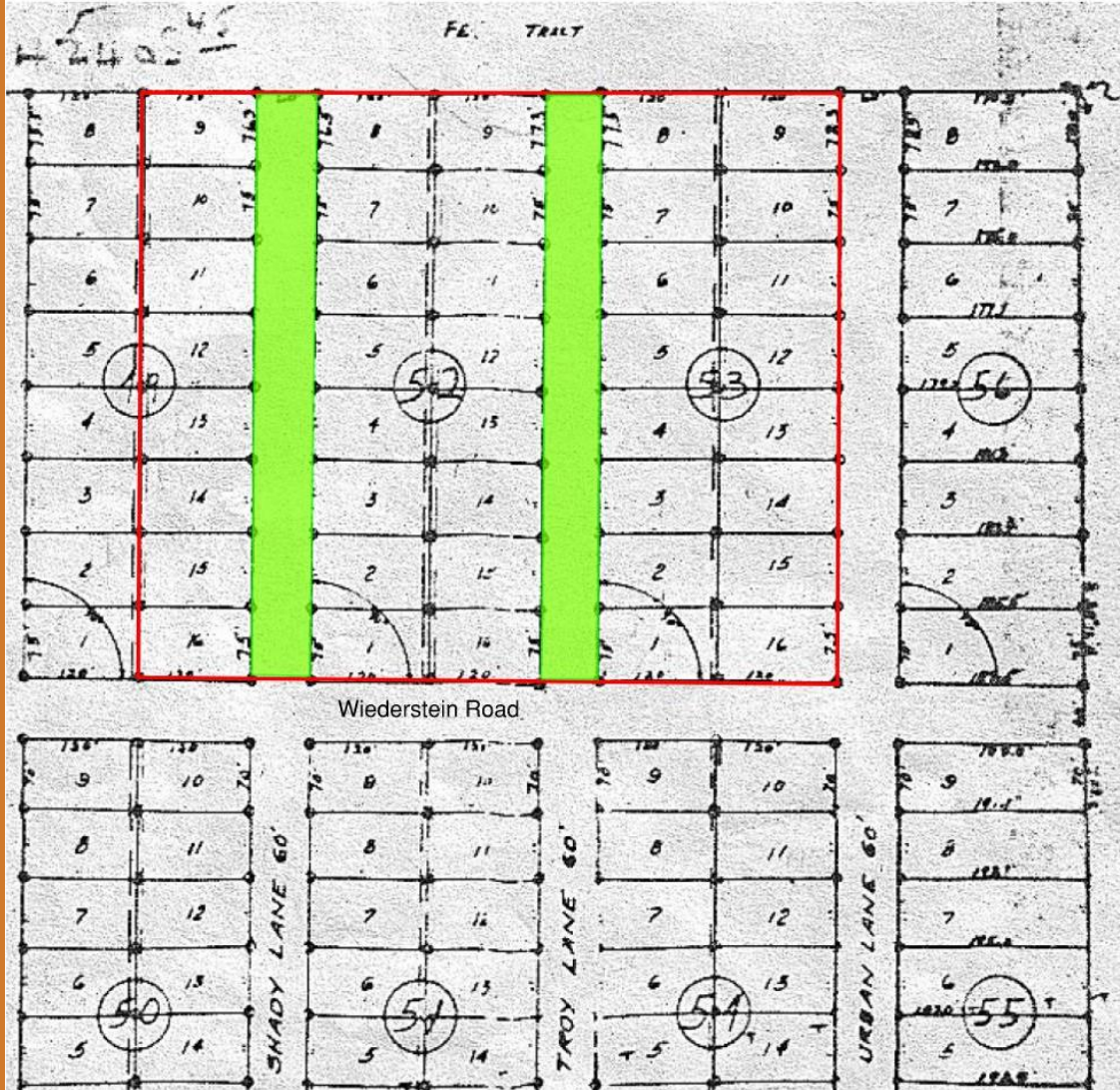
Portion of Live Oak Hills Subdivision Plat