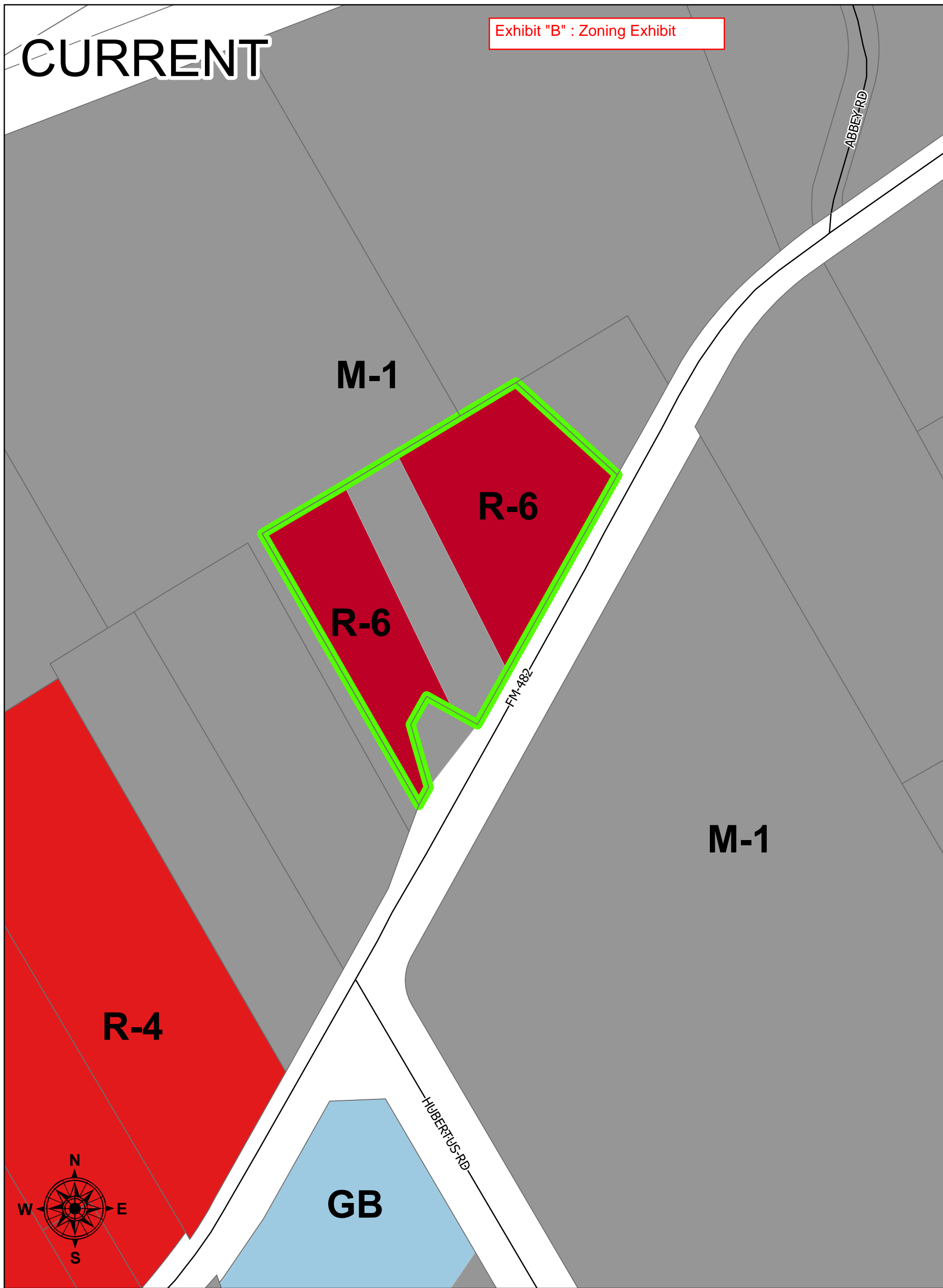
Exhibit "B" : Zoning Exhibit