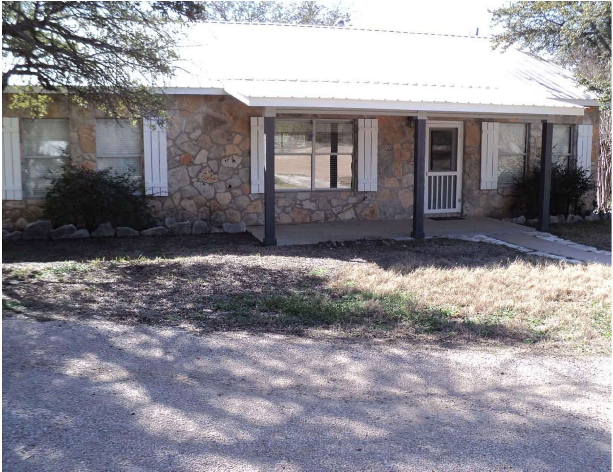
Picture of the Front of the Residence