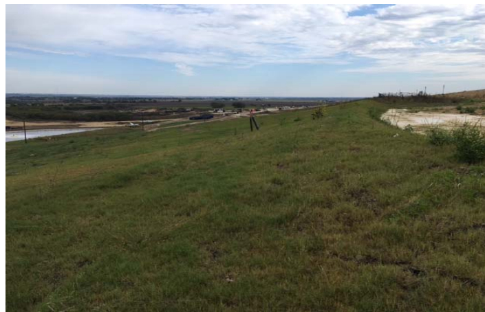
North Slope Vegetation