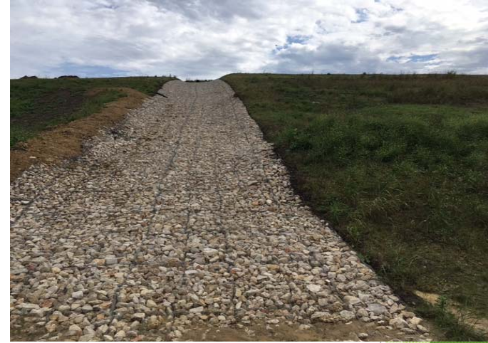
West Slope Erosion Control Drain