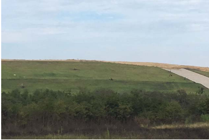
South Slope View from Chandler Road