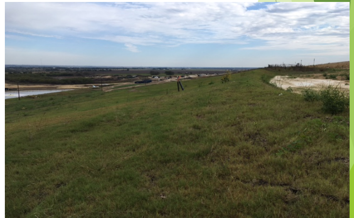
North Slope Vegetation