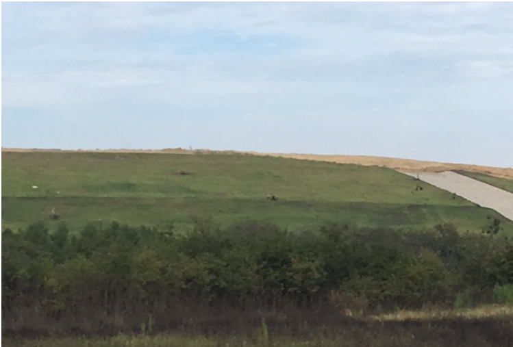
South Slope View from Chandler Road