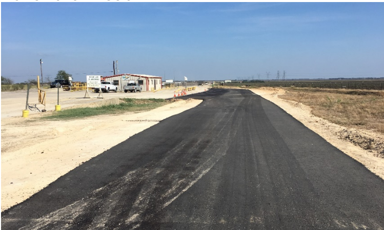
New Paved Road Adjacent To Scale House