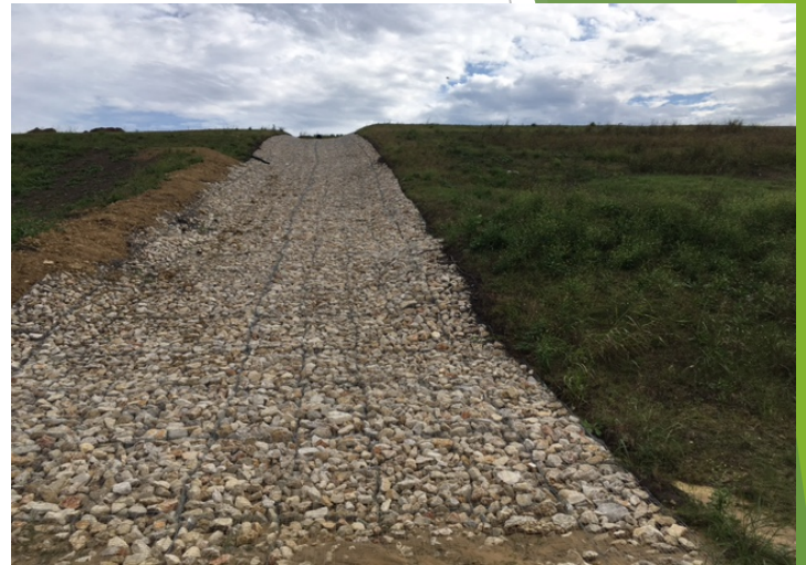
West Slope Erosion Control Drain