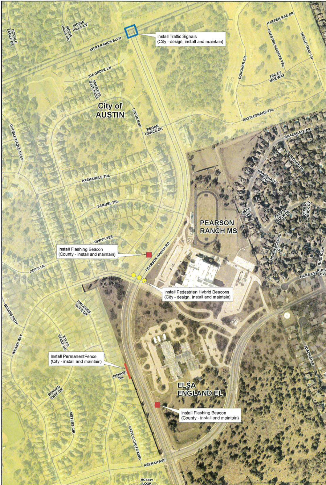
Pearson Ranch Middle School and Elsa England Elementary School