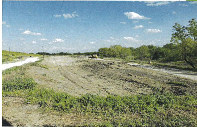
Storm Water Pond Expansion