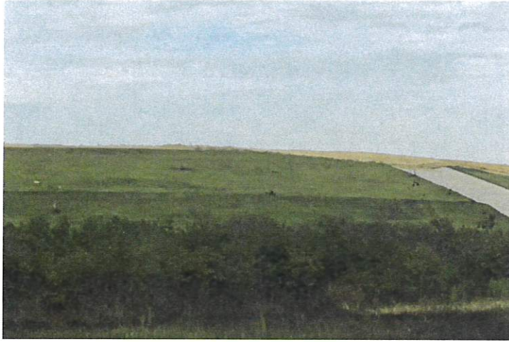
South Slope View from Chandler Road