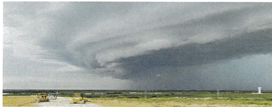
New Access Road