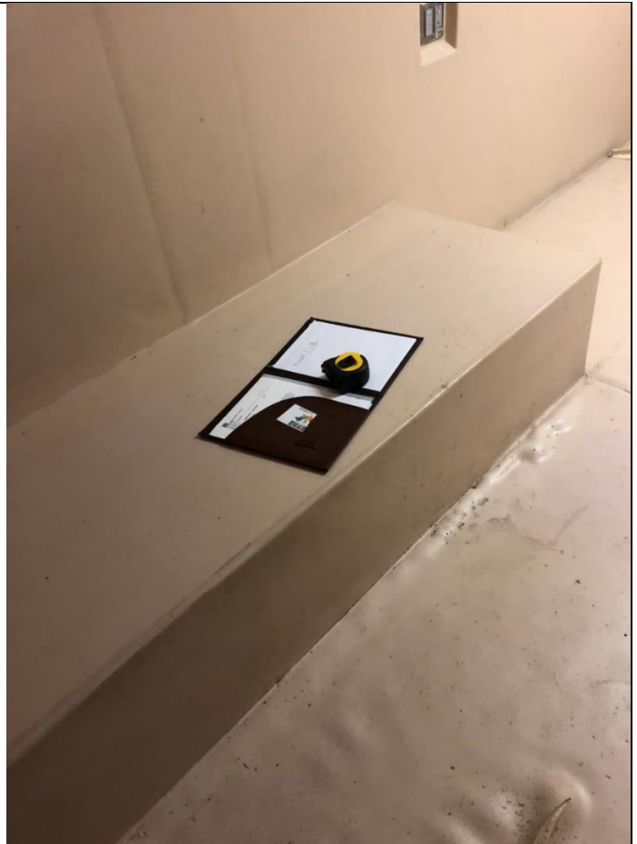
Floor removal and replacement cell I