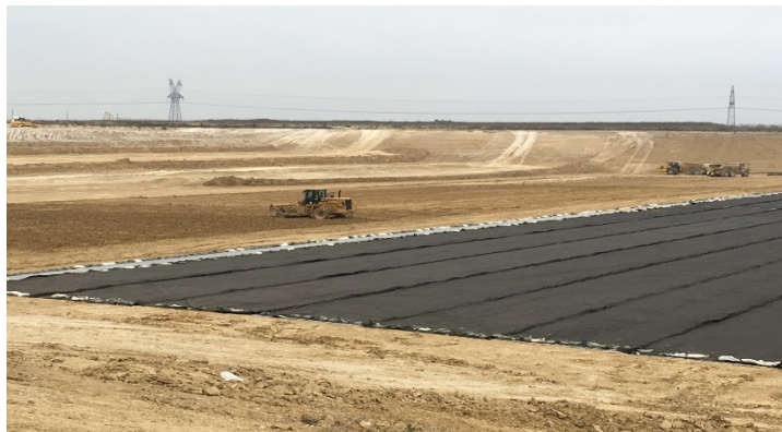
Cell 3A Liner Construction