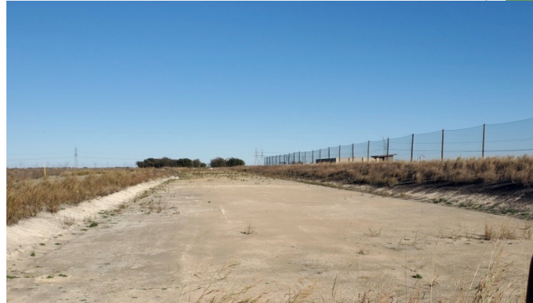
New Storm Water Pond