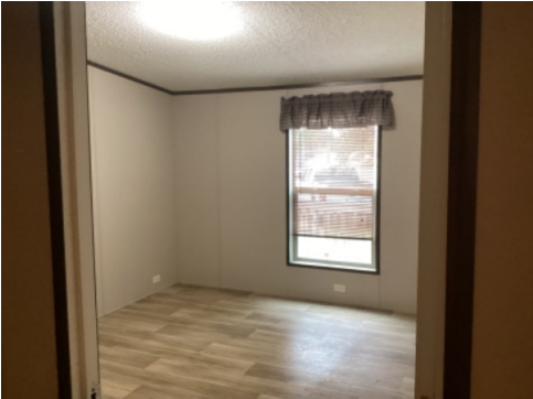
Guest Bedroom 1