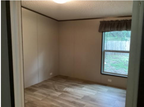
Guest Bedroom 3