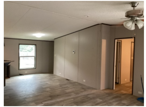
Living Room, Kitchen, and Hallway