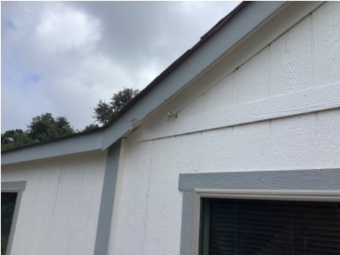
Replace Fascia Along this Peak