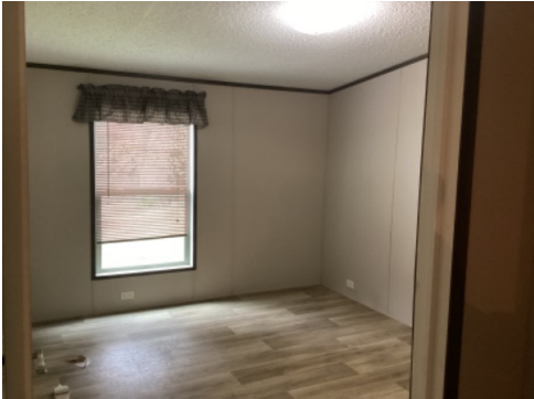
Guest Bedroom 2