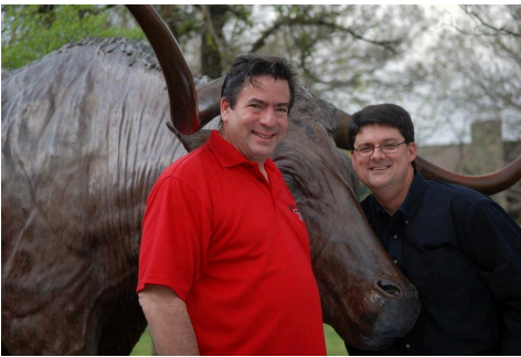
Chisholm Trail Crossing the “Bell Steer” Statue: 1999