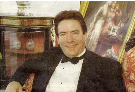
Round Rock Chamber Board of Directors: Chair 1998-1999