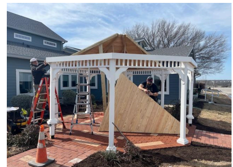
Williamson County Children’s Advocacy Center Gazebo: February 2025