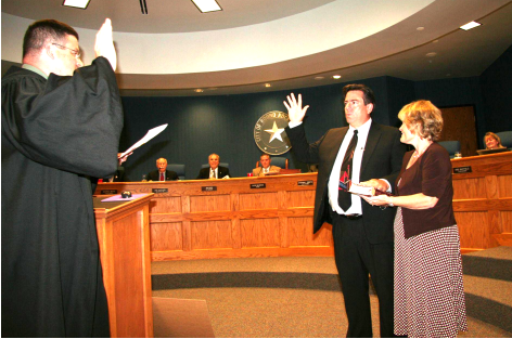
Swearing In Ceremony for the City of Round Rock City Council: May 28, 2009