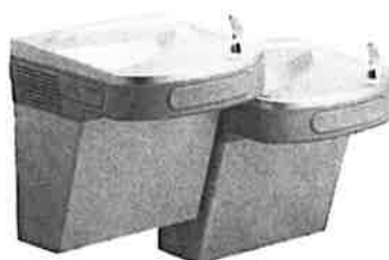
*Versatile cooler configuration as shipped