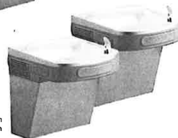
*Versatile cooler configuration alternate installation