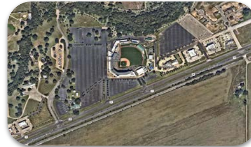
Dell Diamond, Round Rock (Confirmed)

Dell Diamond is the home stadium of the Round Rock Express. This stadium has access to multiple parkings lots capable of running a massive vaccination project. This stadium can serve as the central hub of vaccinations for Round Rock.