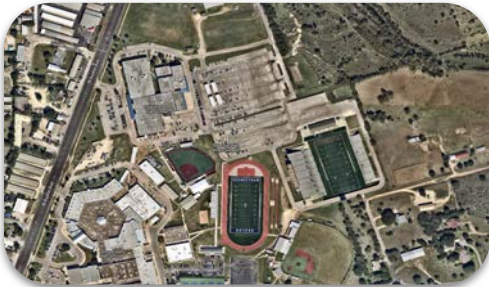
Sun City Retirement Community - Ballroom (Confirmed)

Sun City Ballroom is a large multi-fuction facility that provides ample space for vaccination and monitoring patients. Sun City is an age-restricted community that is residence to over 15,000 active senior citizens.