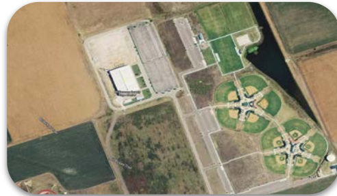
Williamson County Expo, Taylor (Confirmed)

William County Expo is a renown site in Taylor that has two large capacity parking lots where a vaccination center could serve hundreds of patients per day.