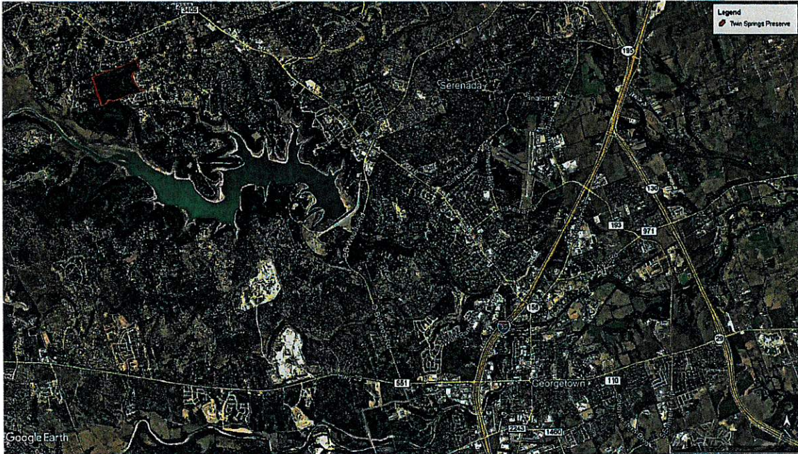
Figure 1. Twin Springs preserve (red bounded polygon) in context with the city of Georgetown, within Williamson County, Texas.