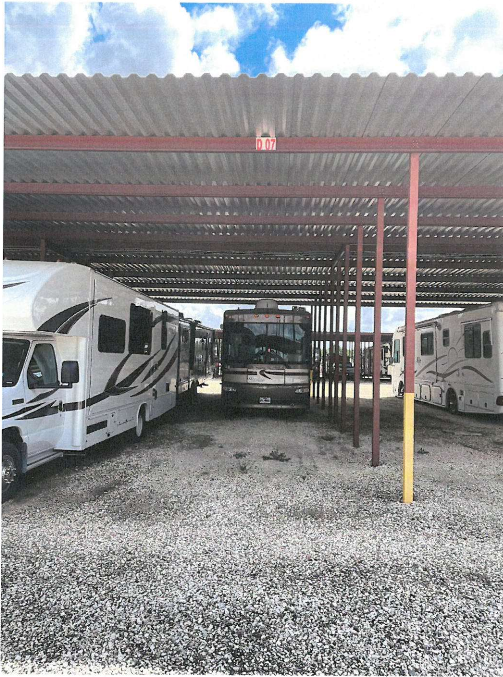
Unit D07 Vacancy Picture