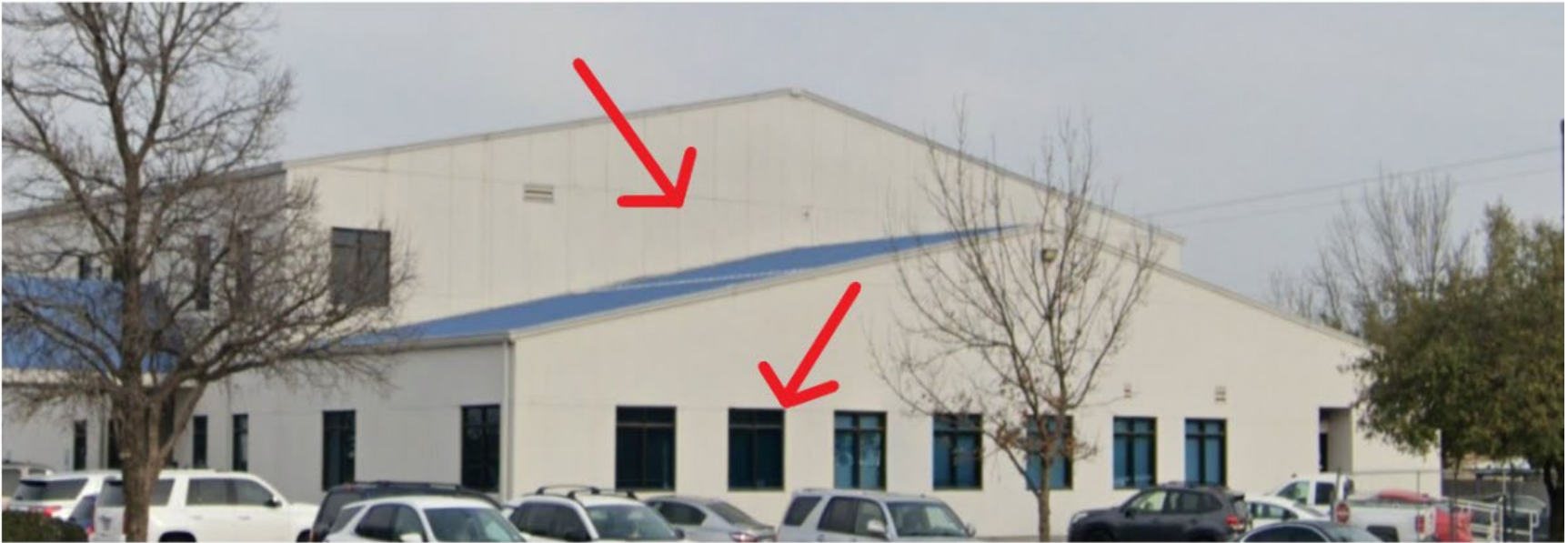
West Side of Building