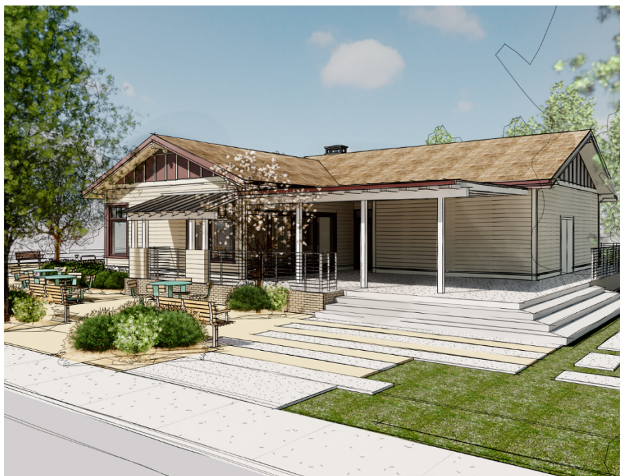
Yolo Branch Library, Covered Activity Area-West Wall