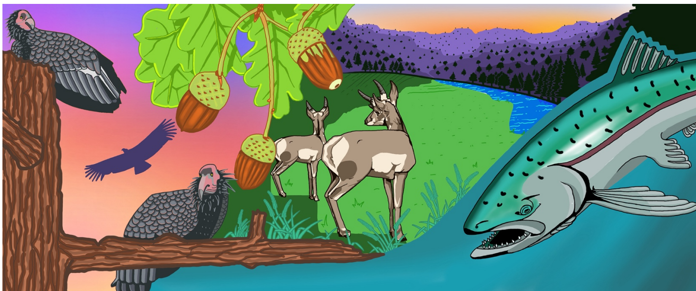
Shayne Oseguera, Digital Rendering, 8'x20' Acrylic paint

The mural design portrays the Pronghorn antelope, Chinook salmon, and the California condor within the Yolo County landscape. These animals were selected to celebrate the majesty of native California species and symbolize the multi-generational abundance of the land. The exaggerated scale amplifies the beauty of these ancient species that are still inhabiting the region today. The digital rendering will be further developed to refine the transitions between each design elements. Collaboration will be facilitated by Yolo County Library and YoloArts to integrate community participation into the mural making process. The final design will be painted on the West wall of the covered activity area using acrylic and spray paint. Coats of varnish will shield the mural from all outdoor elements and an anti-graffiti coat will protect it from any vandalism.