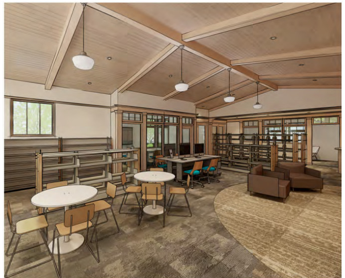
Yolo Branch Library, Collection Room, North Gable