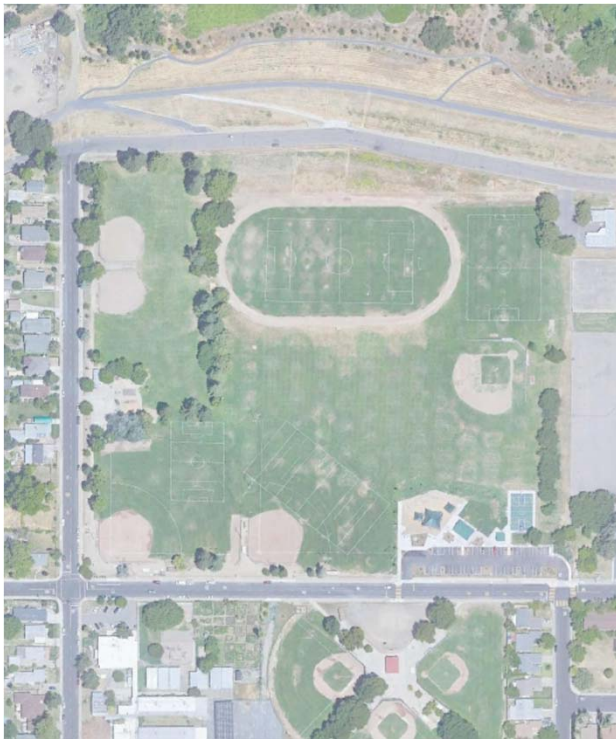
Existing Site Conditions