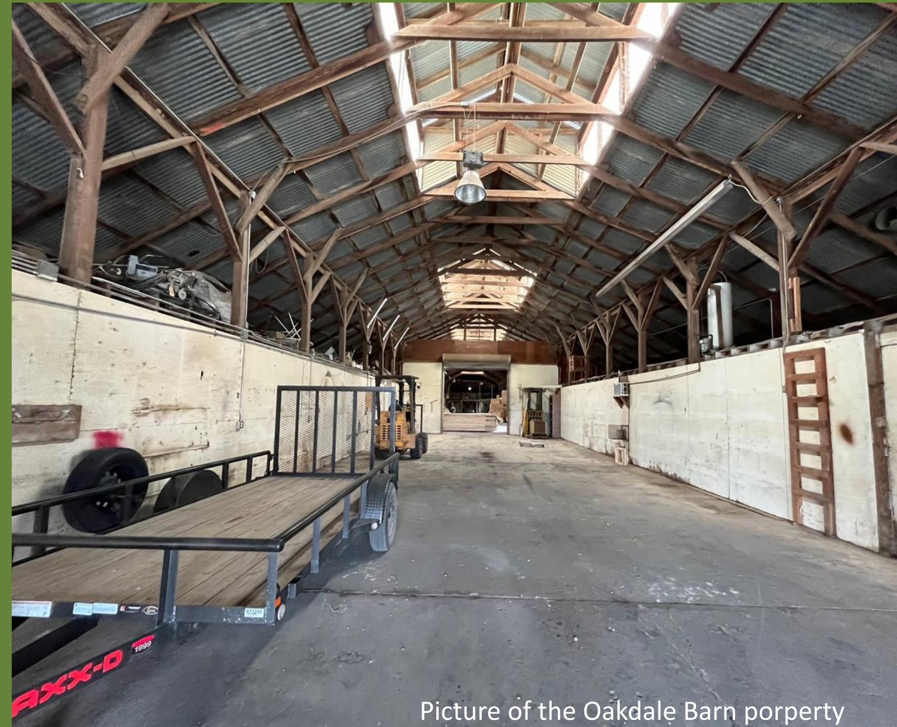
Picture of the Oakdale Barn property

Phase 3 includes purchase and development of the Esparto Depot and existing metal building, designing and installing a commercial kitchen in the Depot, interior renovations throughout, restoring the wood platform/deck on three sides, general site and building accessibility improvements, public parking lot and landscaping. Cost: $3.3M (subject to third-party appraisal).