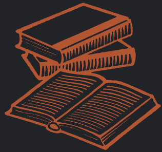
2014 SACOG Food Hub Study

Yolo Food Hub will create new market channels and support for small to medium-sized growers, including new farmers, economically disadvantaged farmers, veterans entering agriculture and others.