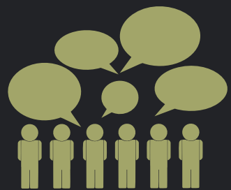
Collaboration and Communication

There is significant demand for the hub from the community, additional and potential partners, funders, and users of the hub.