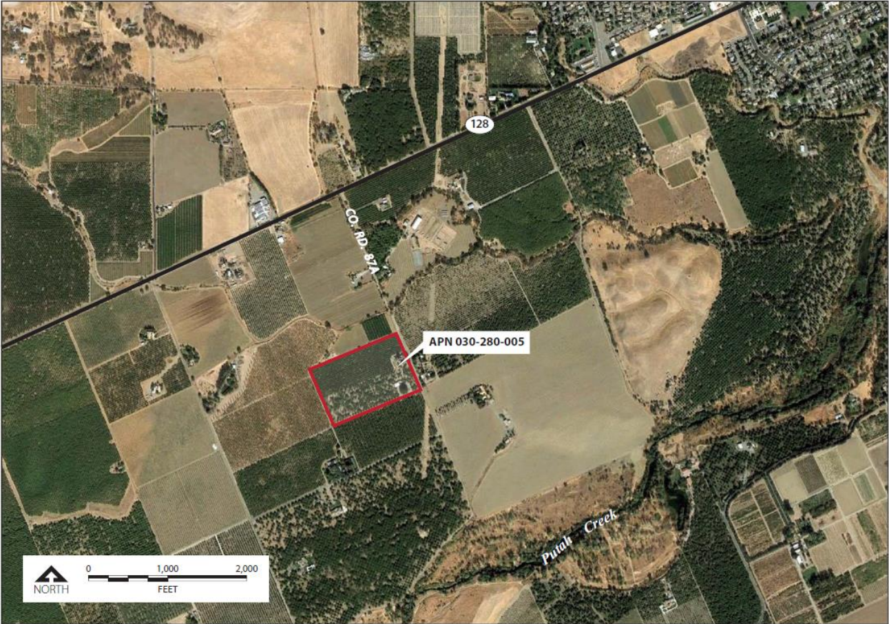
Figure 1. Vicinity Map