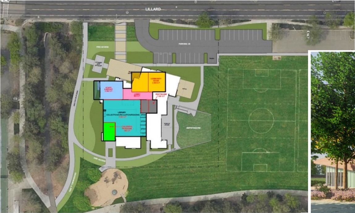
SOUTH DAVIS LIBRARY & EDUCATION CENTER