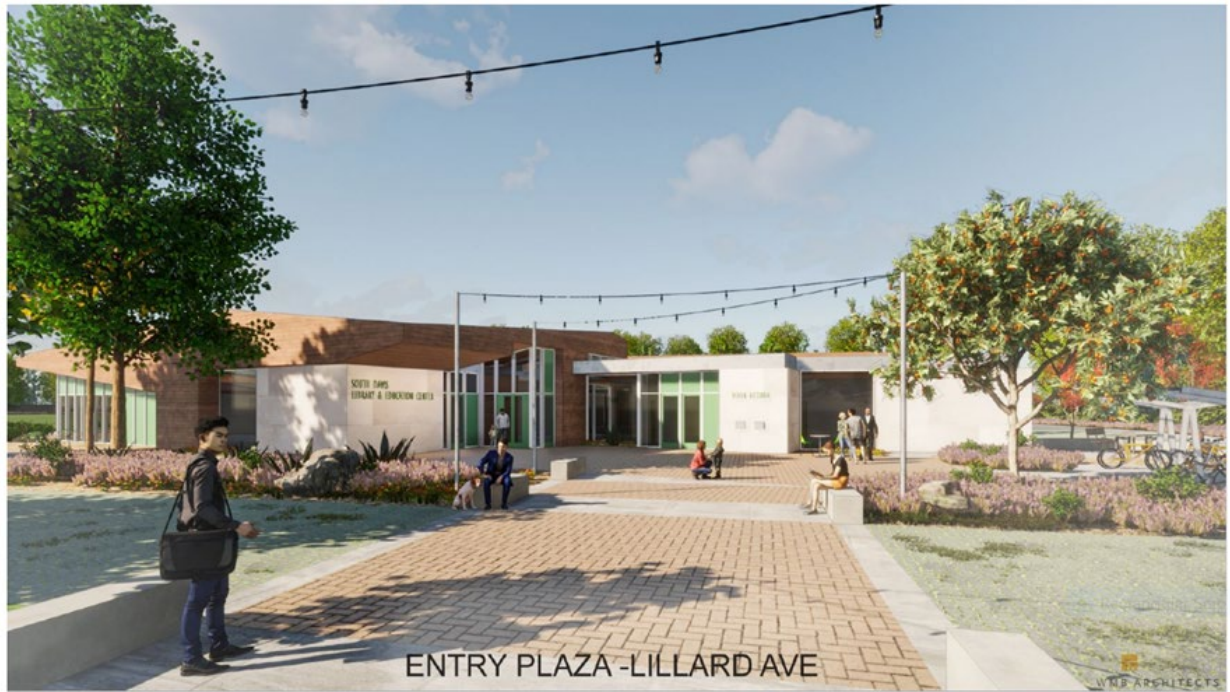
ENTRY PLAZA - LILLARD AVE