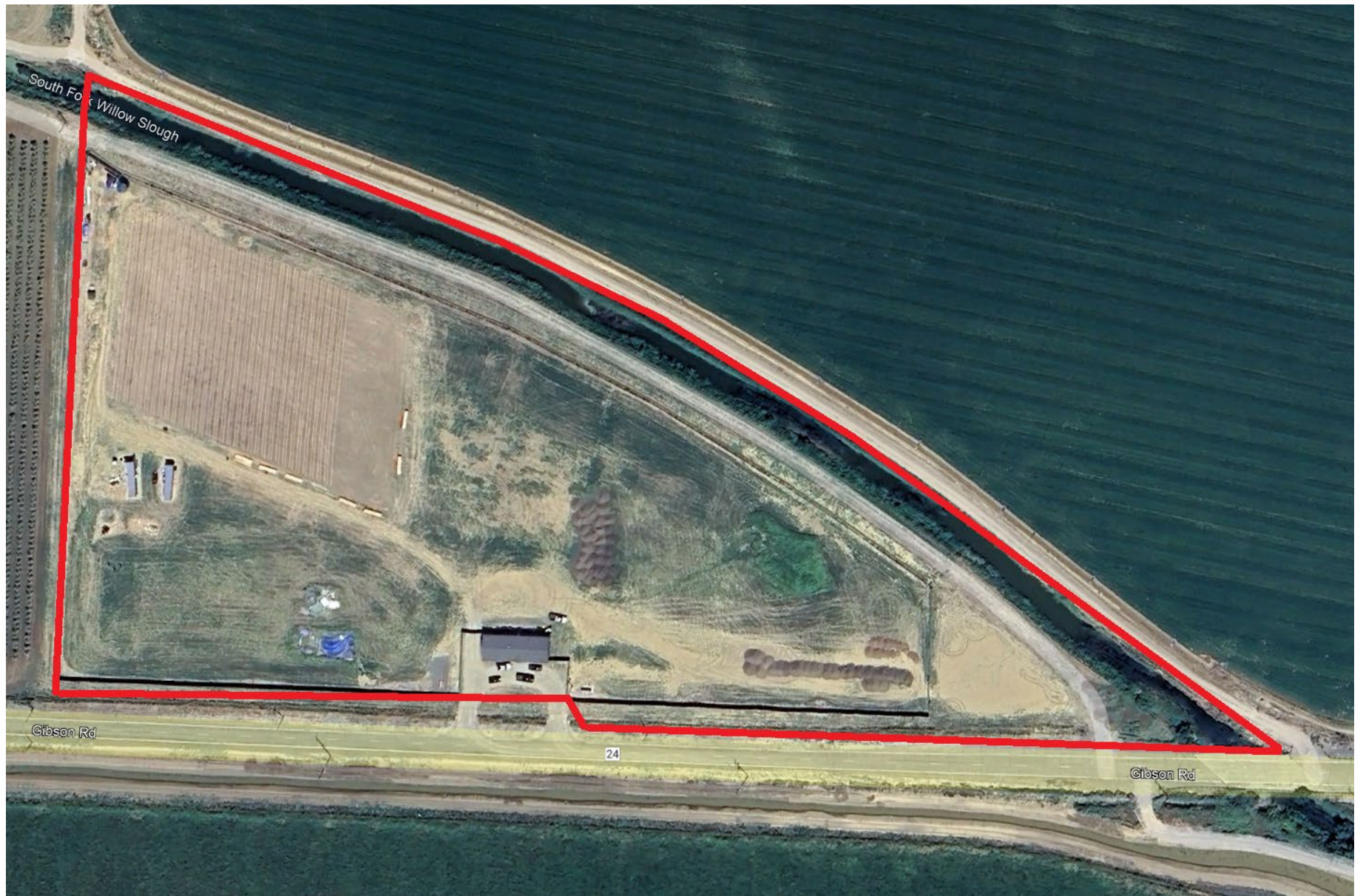
Parcel Lines Approximate