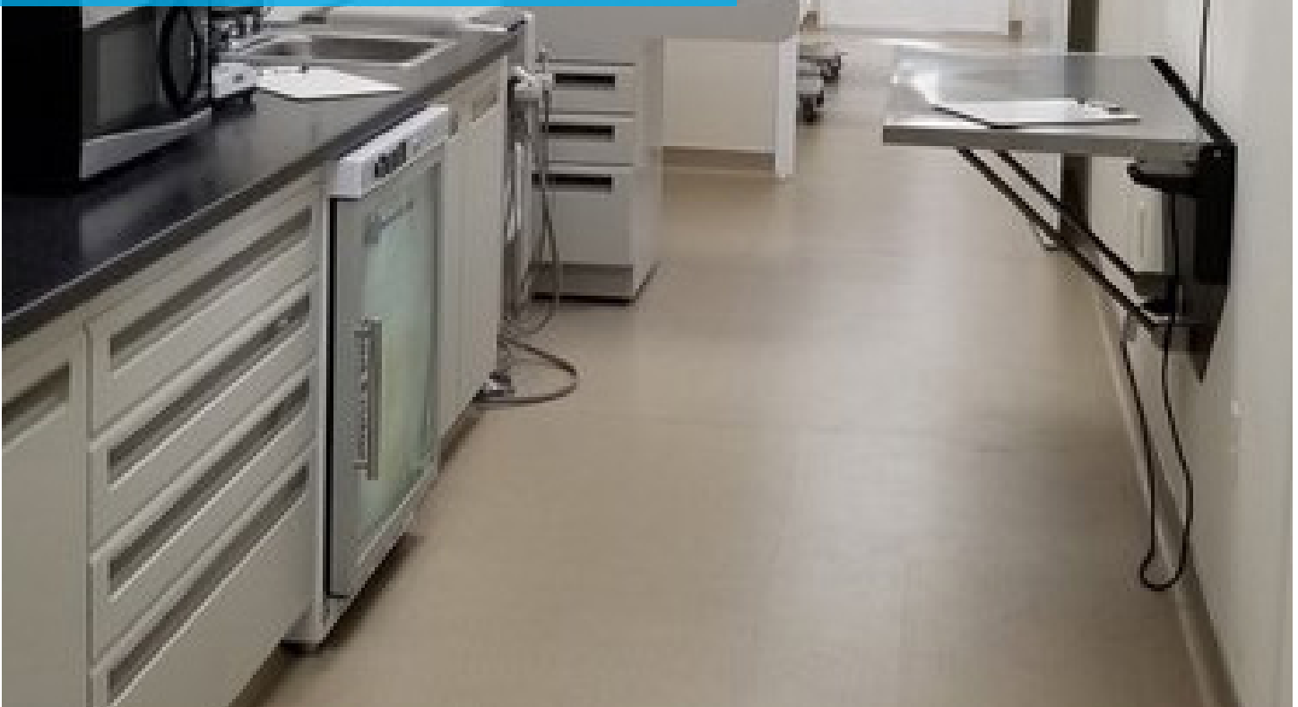
Photo above depicts a double 40 ft Veterinary Clinic project

with equipment, inspections, California stamps and permitting: $327,104 USD