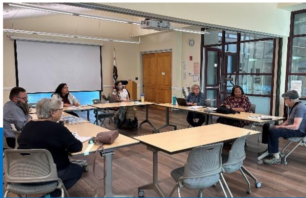
Winters Community Aging Caregivers Townhall

While much work has been done over the years on issues related to aging there has been a renewed focus on the similar and additional needs of persons with disabilities. The commission received public comment, followed by a presentation in February of 2022 from a local mother of a person with an intellectual disability. The comment and presentation highlighted the need to address both the challenges faced by aging caregivers of persons with I/DD and the need for affordable, supportive housing for persons with I/DD. The presentation led to the appointment of an Ad Hoc Committee to receive community input through a series of virtual and in-person meetings throughout Yolo County to hear about the needs of both caregivers, and those living with I/DD. This report summarizes the work of this Ad Hoc Committee and provides recommendations for actions to address these needs.