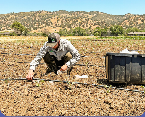
An irrigation evaluation in the Capay Valley for the Mobile Irrigation Lab.