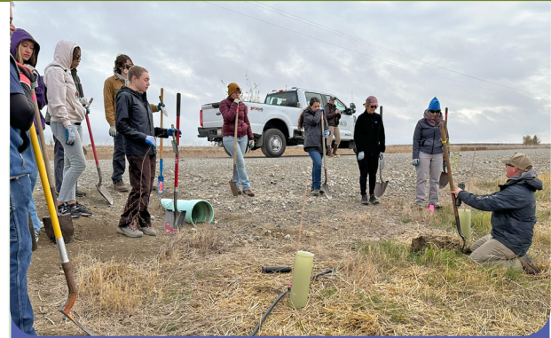
Every year, our staff lead a number of habitat restoration events with community volunteers. Location: Pacific Flyway Pond in Woodland, CA.

The RCD contributes to local and regional natural resource efforts including providing administrative support to the Westside Sacramento Integrated Regional Water Management (IRWM) Coordinating Committee, leading the Natural and Working Lands Technical Advisory Committee for the Yolo County Climate Action and Adaptation Plan, coordinating the Yolo County Weed Management Area, and the Sac Valley Soil Hub. The RCD monitors easements for the Yolo Habitat Conservancy, and connects researchers of conservation practices with interested land managers.