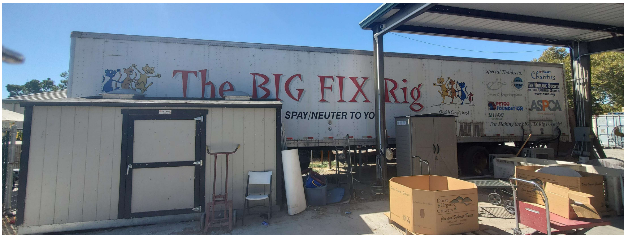
Veterinary clinic for shelter animals Current Big “FIX” Rig repurposed from Hurricane Katrina and brought to YCAS in 2012