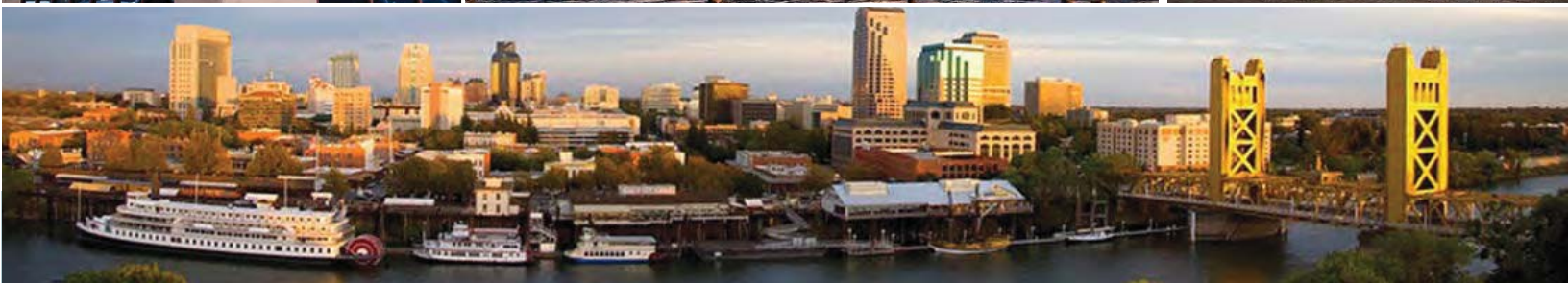
Exhibit B: Qualifications and Experience