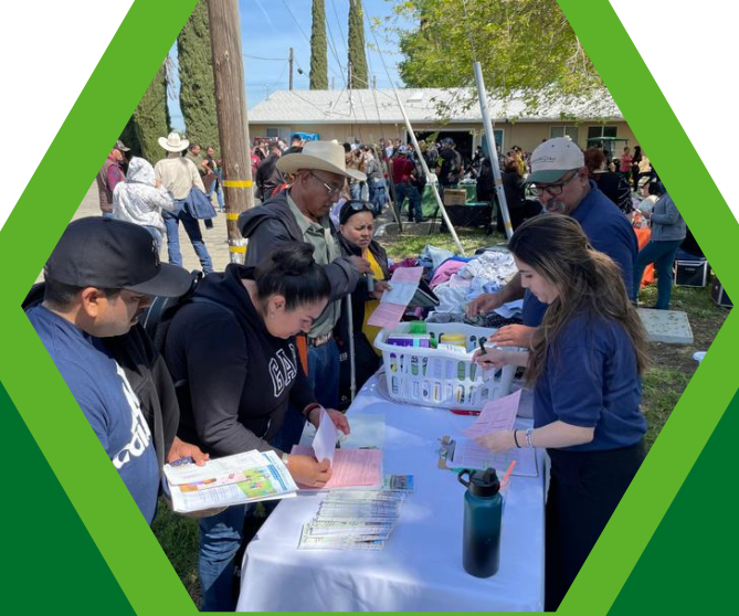
Farmworker Rights and Immigration Forums