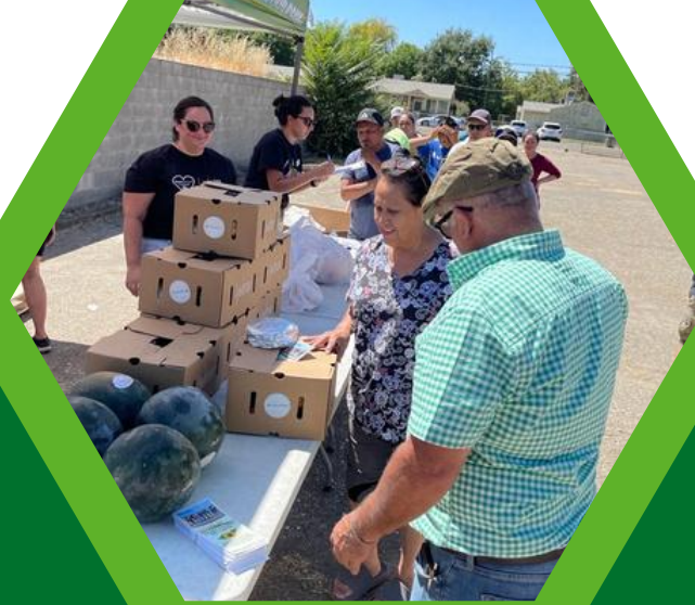
Farmworker Financial Assistance Programs