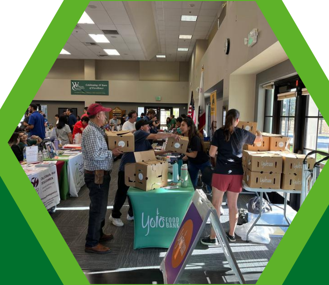
Farmworker Food Distributions