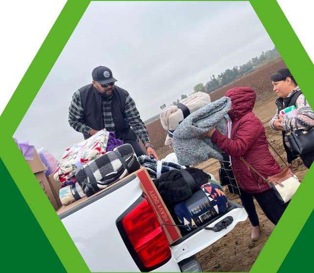
Farmworker Resource Fairs