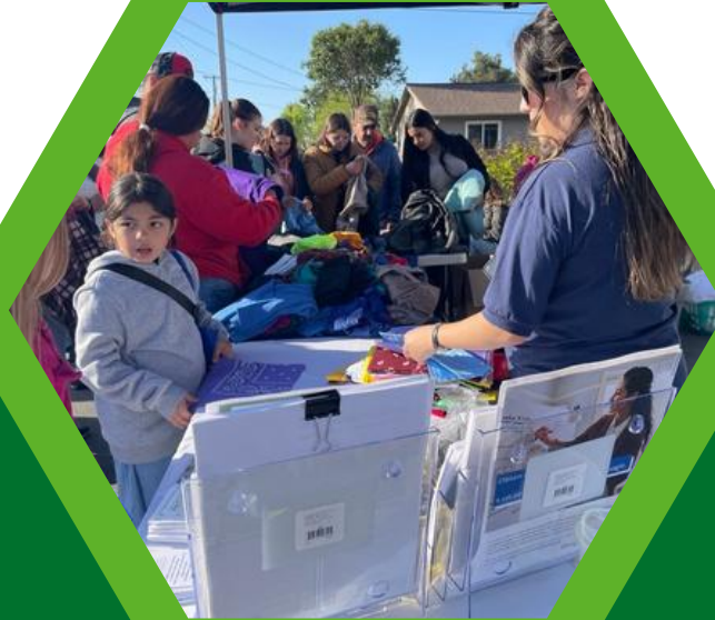
CalFRESH, Medi-Cal, and CalWORKS Connection