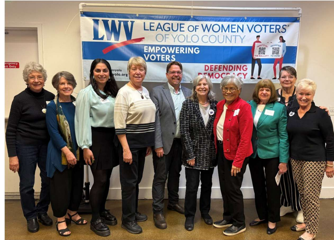
2025 LWVYC State of the Community Luncheon