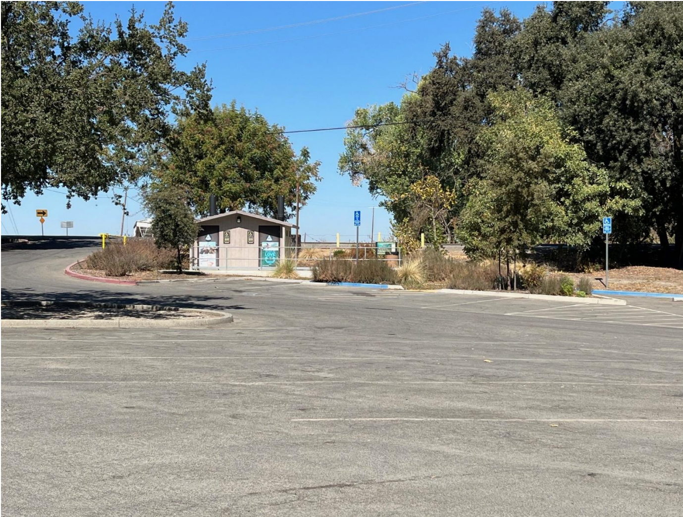
KNFA Entrance and Restroom