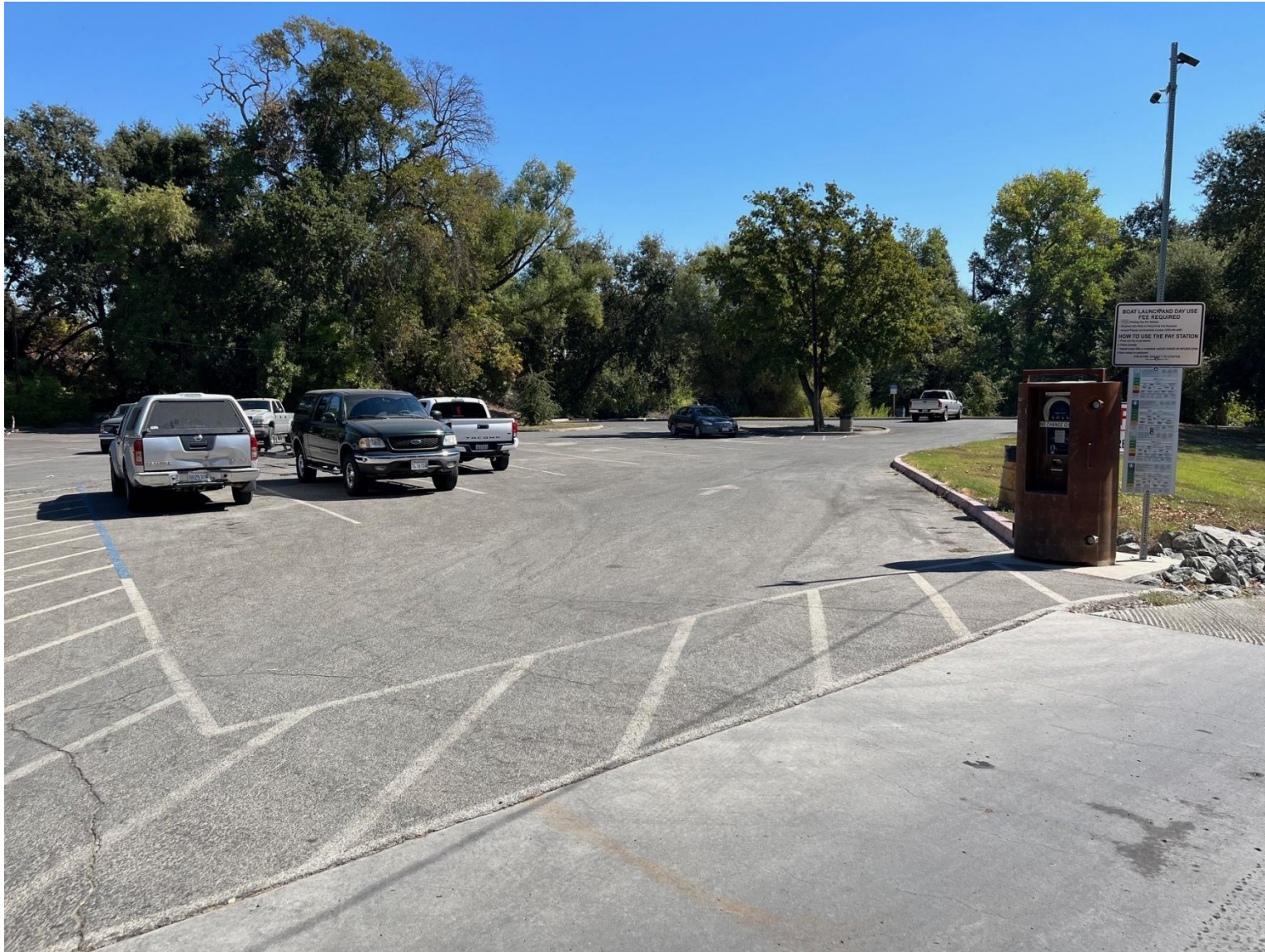
KLFA Parking Area and Payment Kiosk