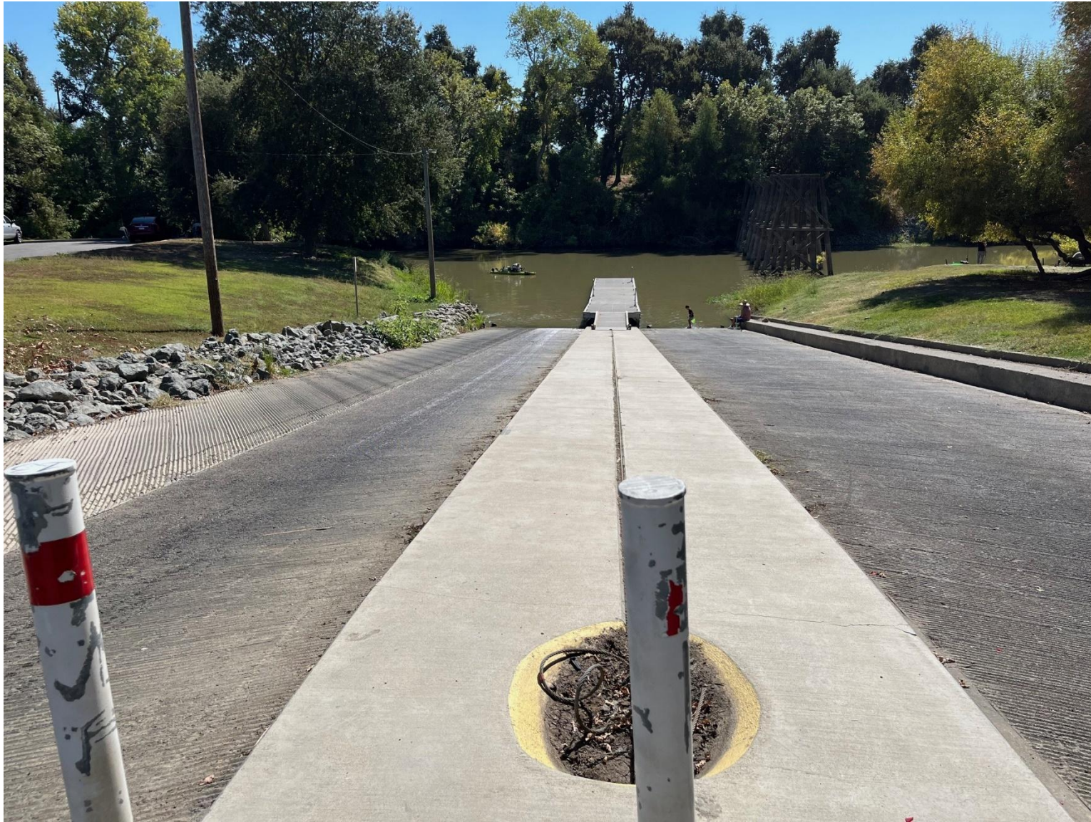
KLFA 2-lane Boat Ramp