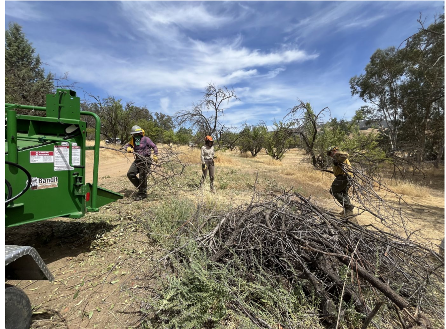
YCRCD Staff at work, July 2025