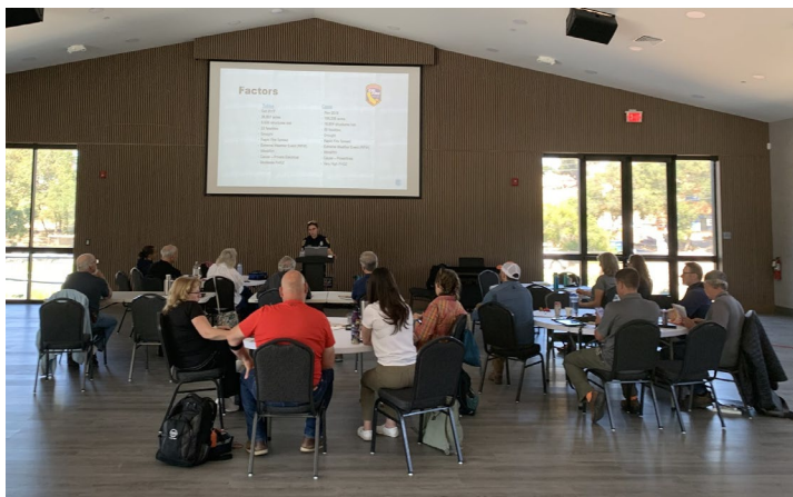
QE Training, St. Helena, Aug 2025