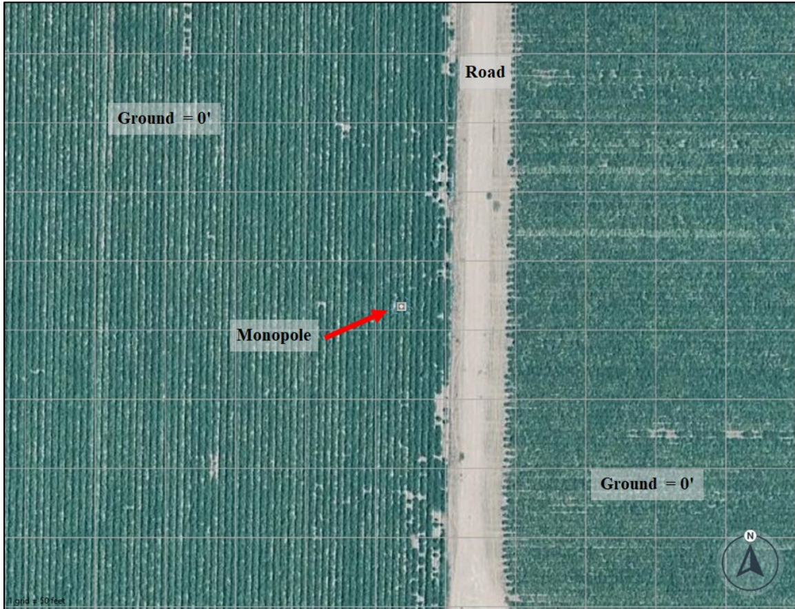
Figure 1: Antenna Locations

The antenna will be mounted on a 140' Monopole with centerlines 136' above ground level. Proposed antenna operating parameters are listed in Appendix A. Other appurtenances such as GPS antennas, RRUs and hybrid cable below the antennas are not sources of RF emissions. No other antennas are known to be operating in the vicinity of this site.