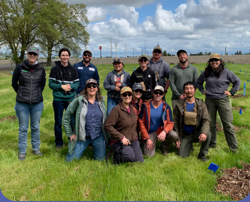
Yolo County RCD staff during a Staff Retreat to a local restoration site.